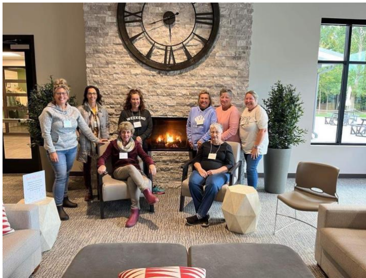
Grace Adventure's Women's Retreat - 2023